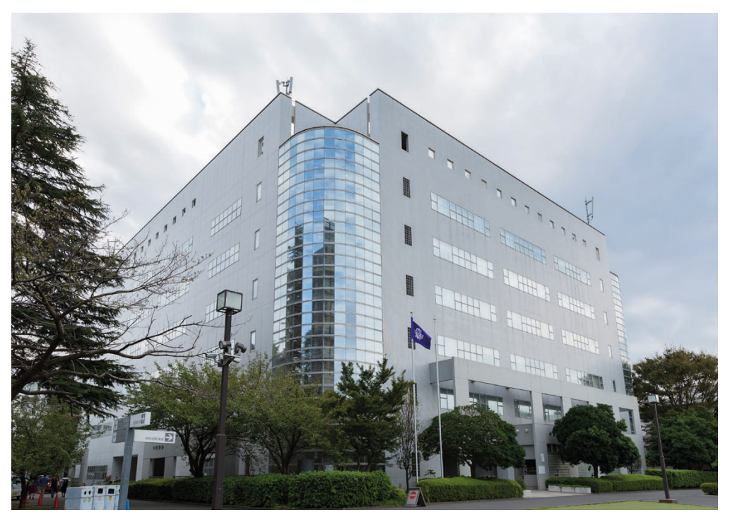
Meiji University, Japan

In the laboratory, led by Professor Atsushi Ogura, the objective is to improve the performance of solar cells and electronics devices based on semiconductor nanotechnology. In October 2018, a significant improvement in material characterization capability was achieved when the Scienta Omicron HAXPES-Lab system was installed. The HAXPES-Lab is a home laboratory-type hard X-ray photoelectron spectroscopy (HAXPES) system with the key components: monochromator, high energy analyzer and a 9 keV X-ray source, the Excillum MetalJet D2+.